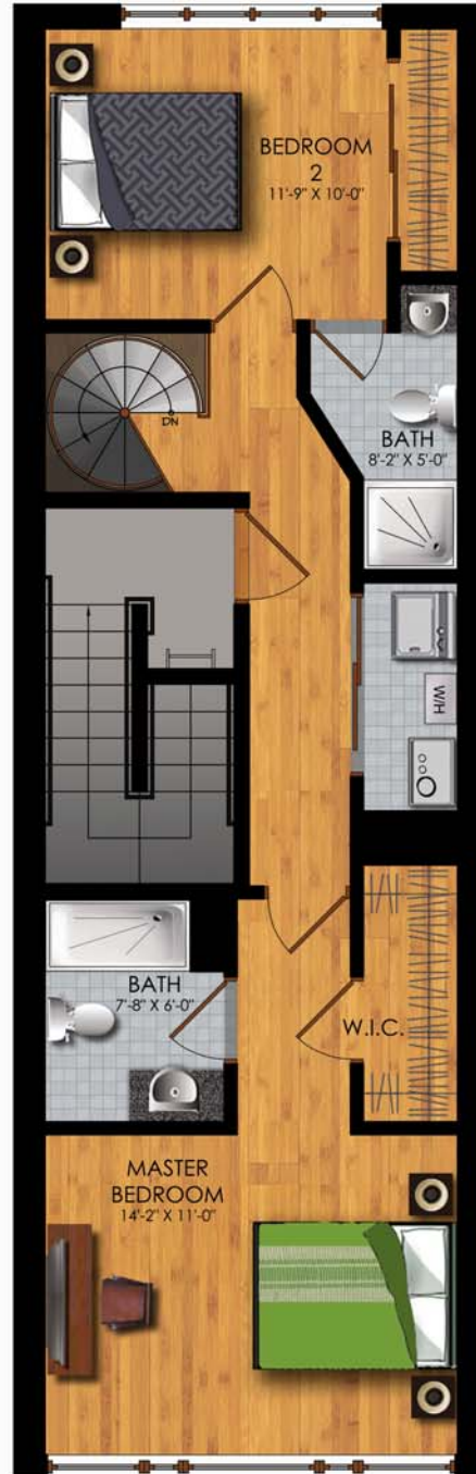
4th Floor Plan - Upper Level